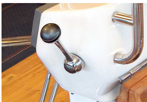
shown without cover plate